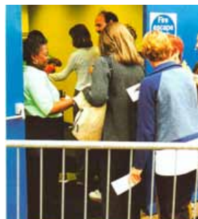
Encourage orderly queuing

123 Protect areas where people are vulnerable to crushing by means of barriers or special design arrangements. For example, relieve and prevent build-up of crowd pressures by using the front of stage barrier used at music events or crush barriers in terraced areas at sports grounds where spectators are standing.