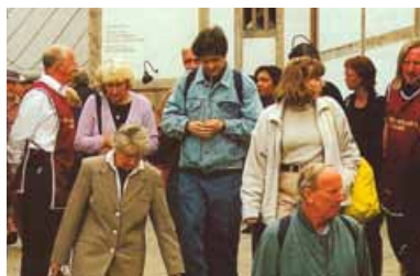
Review event safety as soon as possible