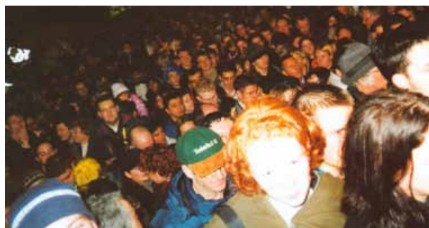
Consider phasing departure

174 Maintain a clear route for emergency vehicles and ensure that the emergency services are aware of the route. This is to avoid emergency vehicles having to compete with departing or other traffic or the evacuating crowds in order to get to the venue.