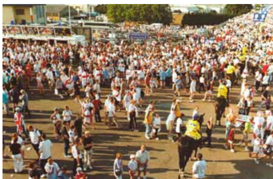
Patrolling the venue

214 Monitoring can also be carried out by staff patrolling the venue. This is appropriate where crowding problems are likely to develop slowly at particular points within the venue. Staff may be given specific areas to check at regular intervals.