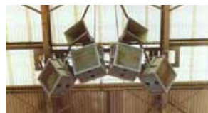
Provide clear announcements

187 Inform people promptly when an event is postponed or transport is delayed; this could be done via display boards, public address system or loud hailers. Inform people of the measures that are in place to deal with the changes. Remember that for evening events people may arrive in the light and leave in darkness - they could be disorientated.