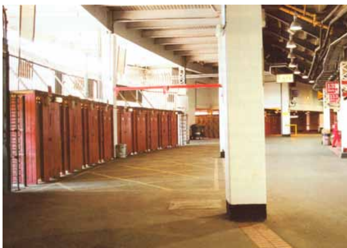
Look for the hazards

72 For the scenarios you have identified, consider the effect the disruption could have on people's behaviour, venue operation, crowd management and on the items or substances you are using. Then identify what new hazards may arise as a result. For example, a severe traffic problem due to roadworks on one of the main approach roads to the venue could lead to a last minute rush and congestion at the entrance to the venue.