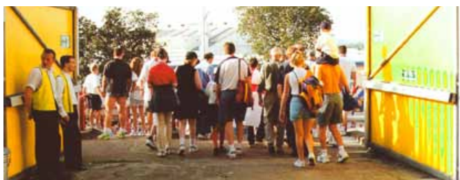
Involve staff in the review