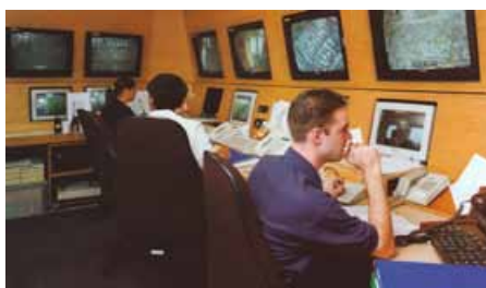
CCTV can be a helpful addition