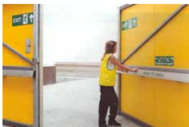
Check existing precautions

81 When estimating likelihood, it is important that you consider how likely the hazard is to occur and to cause harm. This is because not all hazards cause harm all the time. For example, crossflows and obstructions do not normally give rise to a significant problem, unless they take place in a busy area.