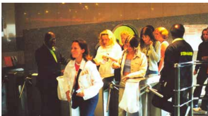
Combining barriers with effective stewarding

113 Consider providing facilities such as toilets and refreshments outside the venue for those who arrive early. These can also be used to attract some of the people away from particularly busy routes or areas.