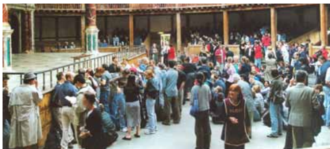
Provide staff with distinctive clothing

141 Train all supervisory staff in the handling of emergencies, and agree the limits of their responsibilities in conjunction with the emergency services at the planning stage. Inform supervisors of the communications system for the event and the working of the control point (see the 'Communication' section). It is advisable for some of the supervisory staff to have received training in first aid, particularly in cardiac pulmonary resuscitation.