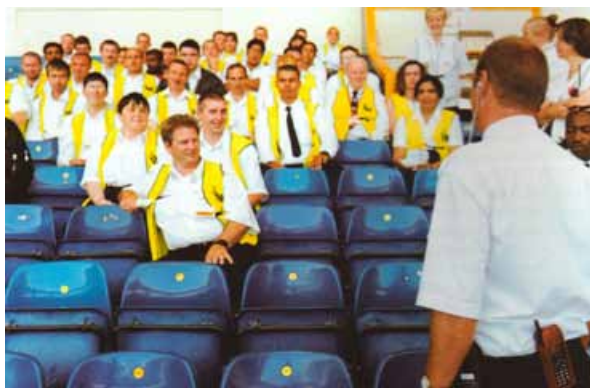
Ensure staff are briefed thoroughly

23 The maximum capacity should be calculated with reference to four factors: